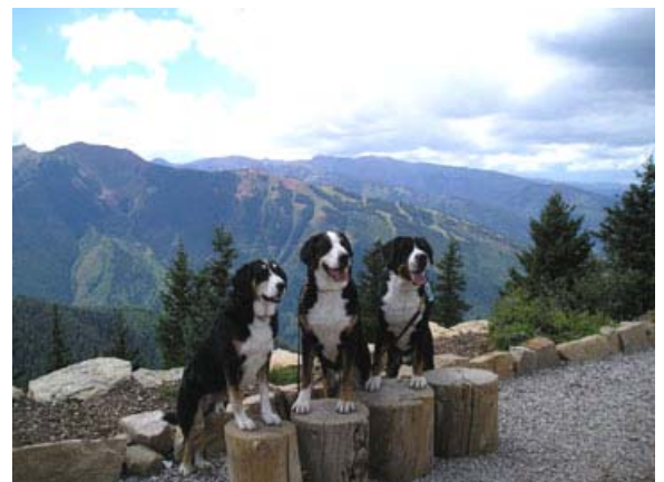
Swissies in the Mountains - how perfect

Please visit the web site and see if there is an area that you can help out with. Let Sandi Snyder know and get ready to have a blast helping out. More detail is inside this newsletter!